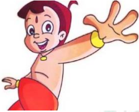
A. Chhota Bheem