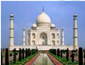
D. Taj Mahal