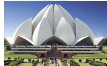
F. Lotus Temple