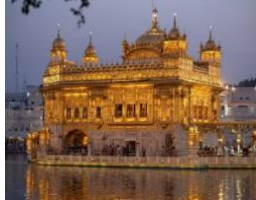
B. Golden Temple