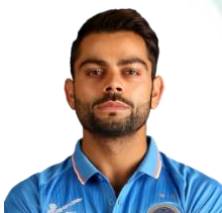
G. Virat Kohli